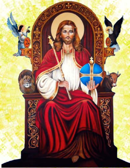
Jesus rules over all things in heaven and on earth. He rules over sin, death, and the devil.

We pray that God would have mercy on us and save us from these enemies, because sin, death, and the devil attack us daily.